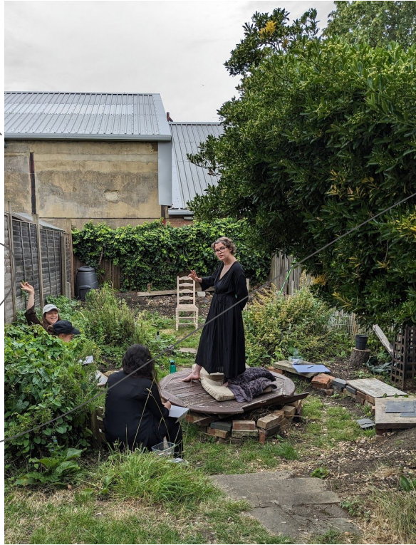
Life Drawing In My Garden